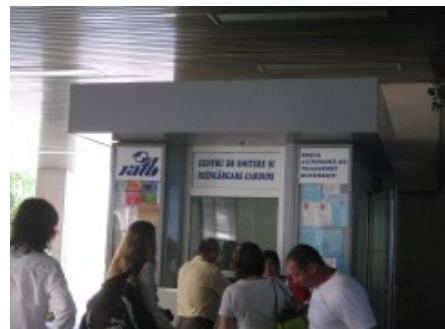
Ticket vending booth

To your right there is a ticket-vending booth. The bus card is valid for two rides and it costs 8.6 RON (approximately 2 EUR).